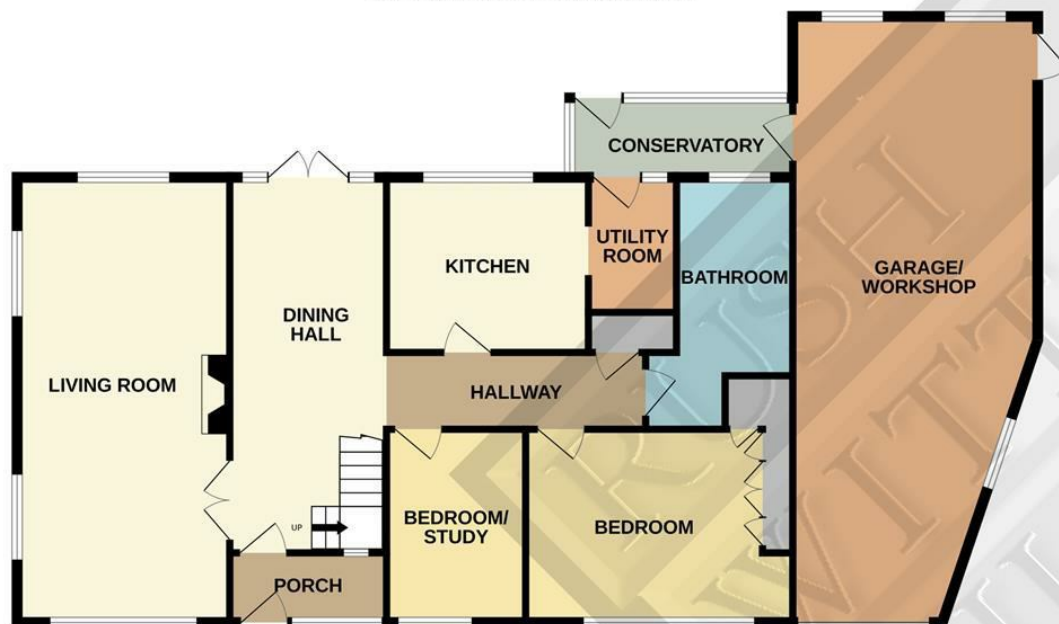
GROUND FLOOR 1450 sq.ft. (134.7 sq.m.) approx.